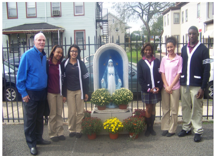
Seniors welcoming alumnus.

idolize and look up to Hubie Brown. He put his head forward and did what many would never think could be done. He never gave up, and always applied himself to the best of his ability.