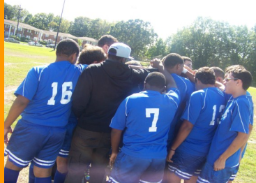
TEAM SPIRIT! Soccer team huddles together before the big game.

He kicks, he scores, goalllll! The soccer team at St. Mary's has been around for three years now. Professional soccer and high school soccer have many differences. The biggest difference is the substitution rule. In high school, when you come out of a game you may re-enter but when you come out of a professional game you can't re-enter.